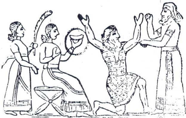
The woman with the cup from Babylon. From Kitto's Bible Encyclopedia.

Now compare this with the early history of the Papacy, and with spirit and modus operandi throughout, and how exact was the coincidence! Was it in a period of patriarchal light that the corrupt system of the Babylonian "Mysteries" began? It was in a period of still greater light that that unholy and unscriptural system commenced, that has found such rank development in the Church of Rome. It began in the very